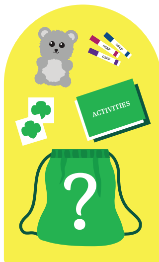
Plush Care Kit

Plush Care Kit – Add a plush friend to keep her company at camp! Assorted plush animals – $35