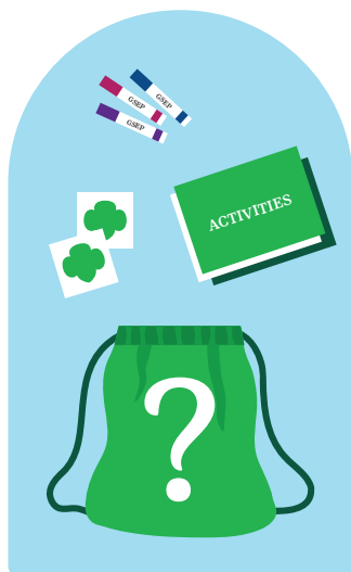
Camp Care Kit

Surprise your camper with a newly improved Camp Care Kit!