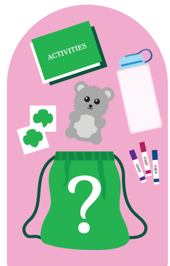
Ultimate Care Kit

Is it your camper's birthday during camp? Let us know, and we'll add some complimentary birthday celebration items!