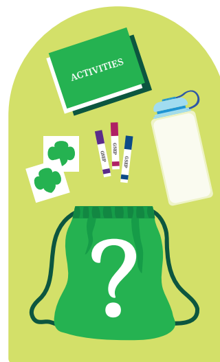
Hydrate Care Kit

Hydrate Care Kit – Add a Nalgene bottle for your camper! 32oz bottles with a wide mouth opening in assorted colors. – $40